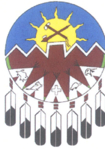
TREATY No. 7