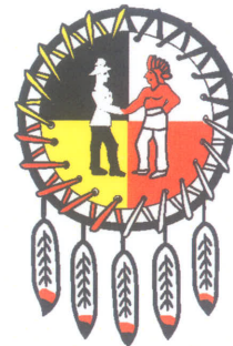
TREATY No. 8